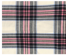
WHITE WHITE PINK CHECK