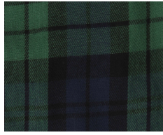
200C RED NAVY CHECK